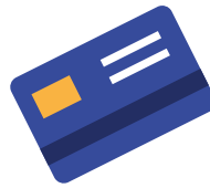
Credit Card Bills

Kashable can also help with expenses like...